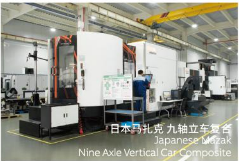
日本马扎克 九轴立车复合 Japanese Mazak Nine Axis Vertical Car Composite