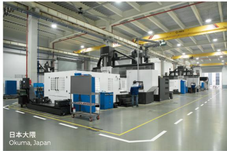
日本大隈 Okuma, Japan