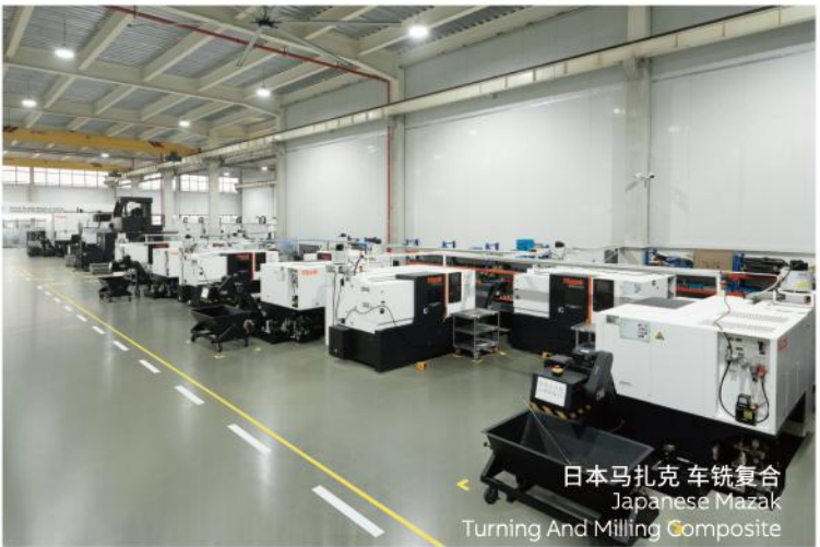
日本马扎克 车铣复合 Japanese Mazak Turning And Milling Composite