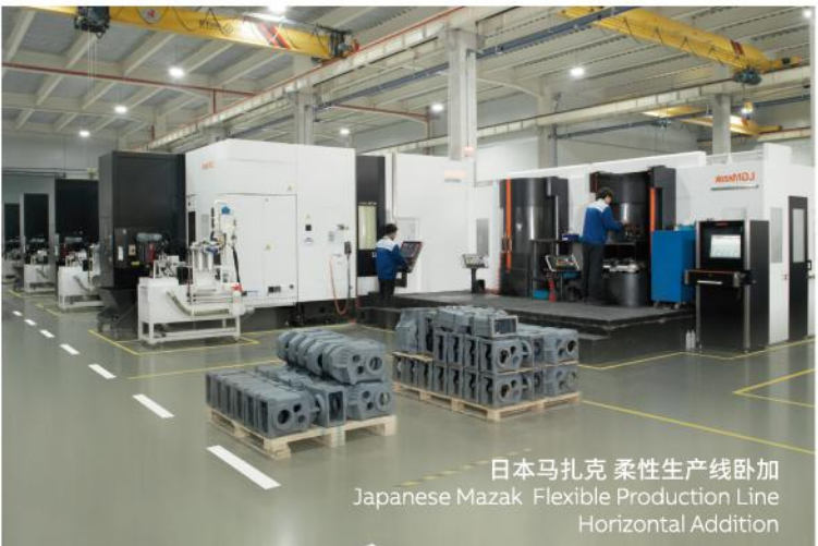
日本马扎克 柔性生产线卧加 Japanese Mazak Flexible Production Line Horizontal Addition

欧诺拥有领先的研发技术，智能的制造装备，标准化的 车间管理，根据你的需要研发和生产，保证你的品质。 With the advanced research and development technology, intelligent manufacturing equipment, standardized workshop management, Ounuo are able to serve you qualified products based on your request.